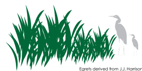
Natural resource projects