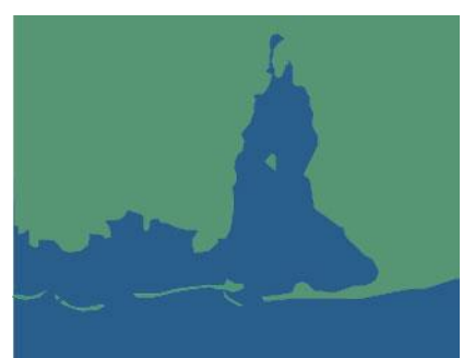
Barrier islands and river diversions